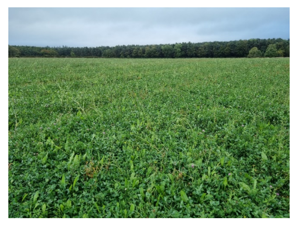
Figure 3 Legume and herb rich leys

Fertiliser prices are the hot topic here at the moment. Urea has gone from £280/t last year to nearly £600/t. Luckily, we bought our N earlier in the year when prices were lower, but we still have grassland fertiliser to buy. Ultimately, we cannot afford to pay the high prices now so we will have to be more efficient with our N use and be smarter using our organic matter on the farm such as slurry and manures. The legume herb rich leys (pictured opposite) we are growing without the use of artificial fertiliser have grown really well. When fertiliser prices are so high, we will really see the financial benefits of such crops. Beef prices have been strong over the past