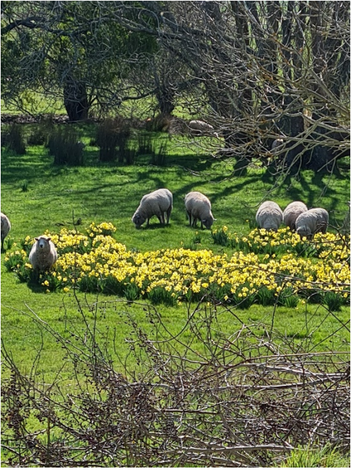
Page 11 of 12

The sheep which have been our bread and butter for 150 years will be sold except for 100 or so. These will be needed for keeping the area around the house short and clean. They will also be very beneficial for cleaning up the calf paddocks once the calves have been weaned and moved to bigger paddocks.