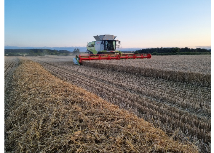
Figure 2 Wheat harvesting & swathed straw for baling

We had three new staff members start since the last report. Staff is always one of the biggest challenges, but we are building a good team which I can rely on. The new team members are settling in well and doing a good job. There is always an element of the old and new members trying to assert themselves in the pecking order which can lead to