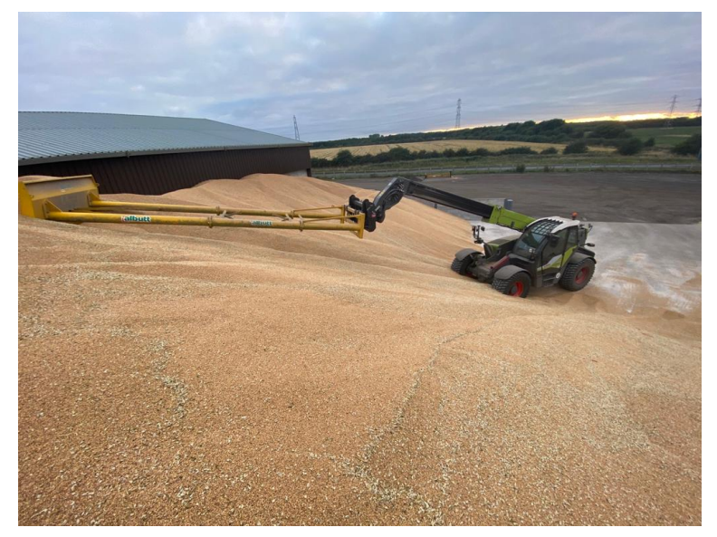
Figure 1 Stockpile of wet Wheat awaiting grain drying and undercover storage

Oilseed rape yields were generally good across the farms ranging from 3-4t/ha. Prices are also strong this year hitting a peak of around £540/t.