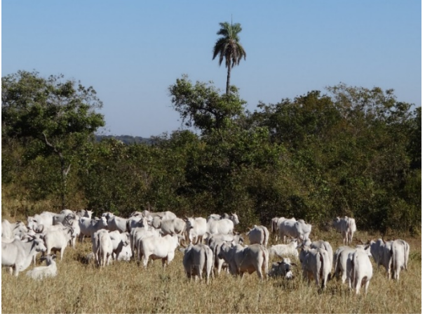
Page 13 of 14

We had a challenger dry season this year. It has rained 200mm less than last year and the shortfall rain affected our plans. More than 2 months with no rain and a bad condition of pasture for cattle. It was a tough winter and we also had frost for three times in the entire area. I've never seen something like that. Despite all the challenges we have used the winter pasture as a strategy and brought us some relief.